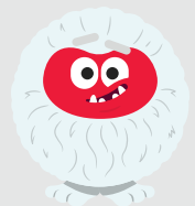
THE ABOMINABLE SNOSEMAN